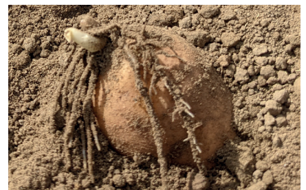
Pay attention to the plant stage