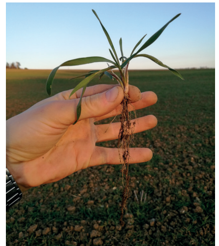
The crop is usually firmly rooted